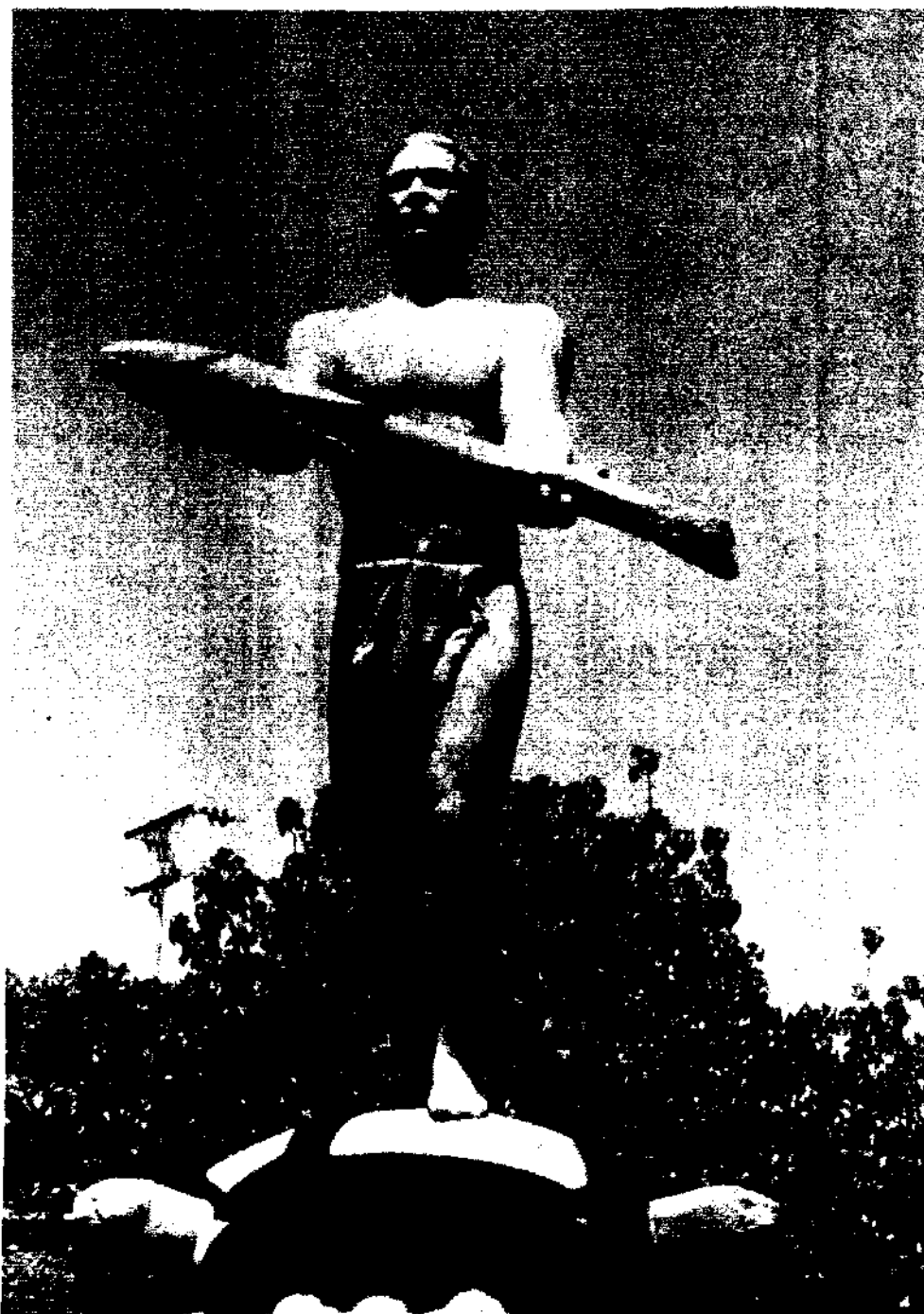
Statue in Cumana, Venezuela commemorating the Indian fishermen of the region.