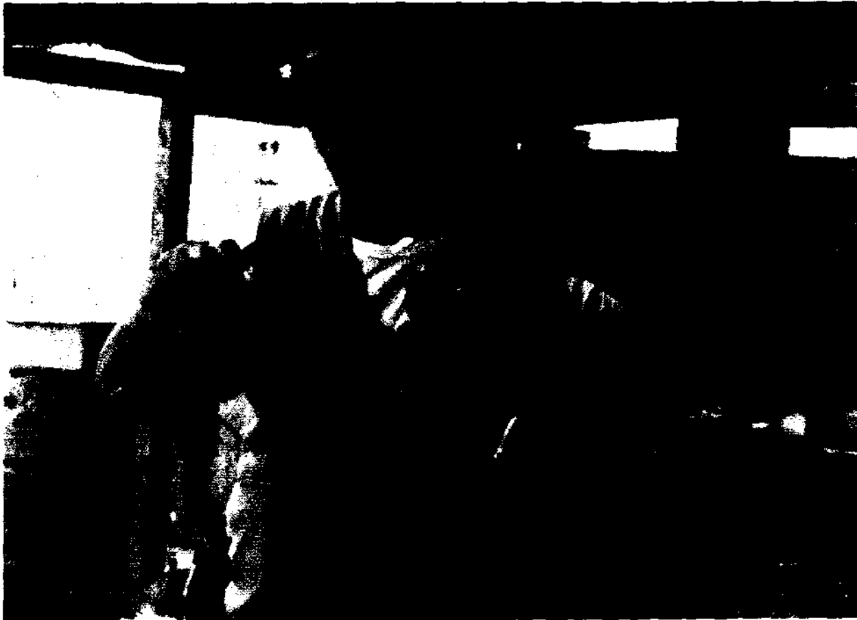
Mexican crabber displaying large male C. bellicosus .

On the Baja, some processing plants are located over 50 kilometers (30 miles) from the harvesting sites. This is due to the isolation of the coastline and the poor network of roads connecting sites to processors. For the Bahia de Magdalena fishery, primary processing sites are at Port San Carlos and Concepcion. Along the eastern side of Baja California, crabs are many times transported to the other side of the Gulf of California for processing at Guaymas, Los Mochis or Guasave.