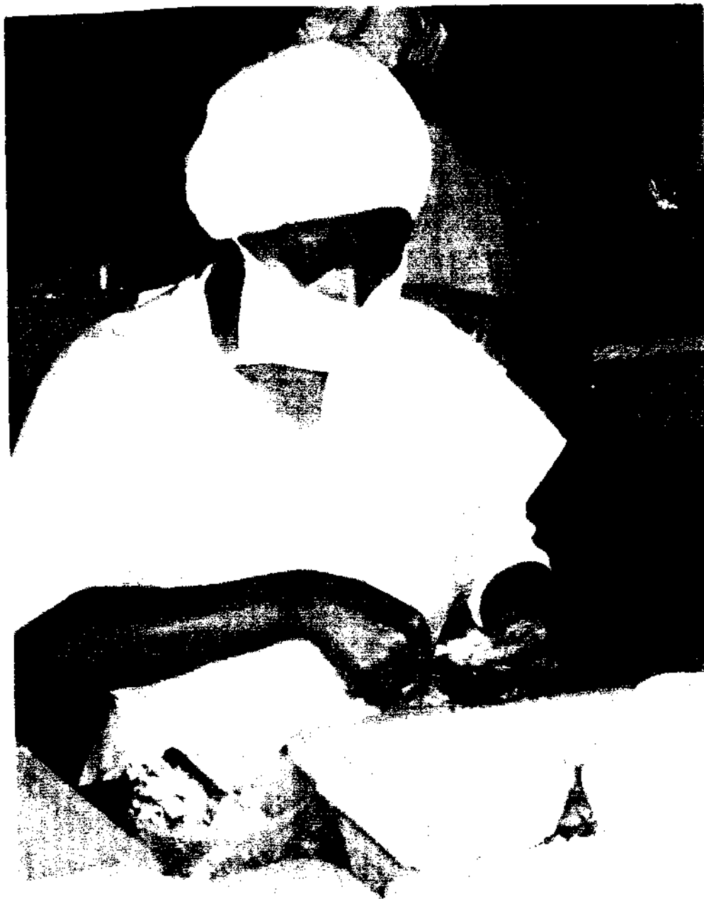
Picking crabmeat in Ecuador. Workers wear gauze face-masks, hairnets and white uniforms in attempts to reduce potential bacterial contamination.