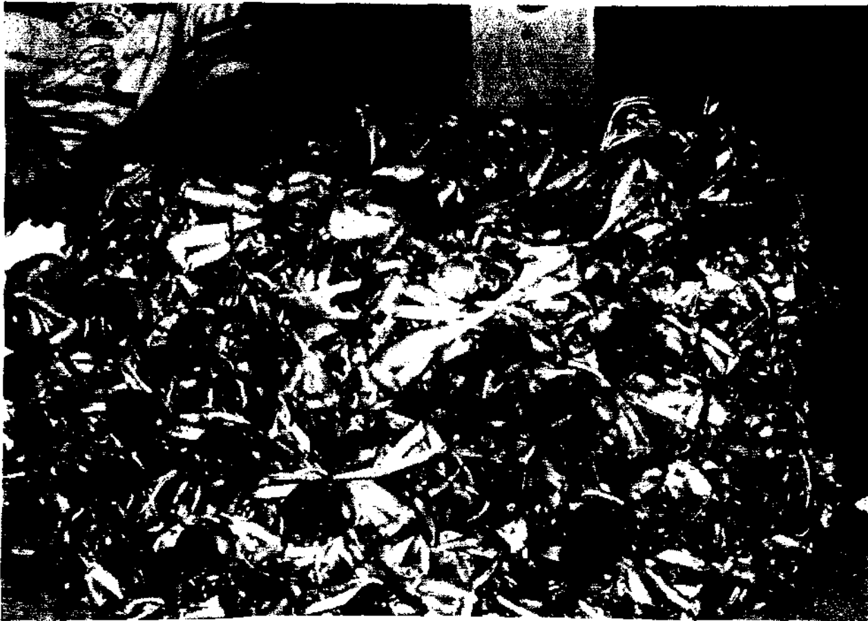
Ecuadoran burrowing crab, Ucides occidentalis , "bundled" for sale at a local seafood market.

Guayaquil is a large industrial city situated on the upper estuary of the Golfo de Guayaquil. The adjacent river outflow is tremendous, with tons of organic debris from the jungle mixed with urban waste pouring into the river. The tidal flow is extremely strong in this system. Presently there is a strong seafood industry infrastructure centered around shrimp aquaculture in the area. Guayaquil is the center of the Ecuador shrimp culture and processing industry. Despite the presence of a well-developed seafood industry and the Castro et al. study, the swimming crab fishery has been slow to develop. This can be attributed to the presence of jobs in the shrimp industry, harvesting difficulties associated with the physical conditions of the estuary, and a historical fishery for another indigenous crab species, Ucides occidentalis , the mangrove crab. Ucides is a much sought after burrowing crab that is considered by natives to be far superior to other crab species. In the Guayaquil region, restau-