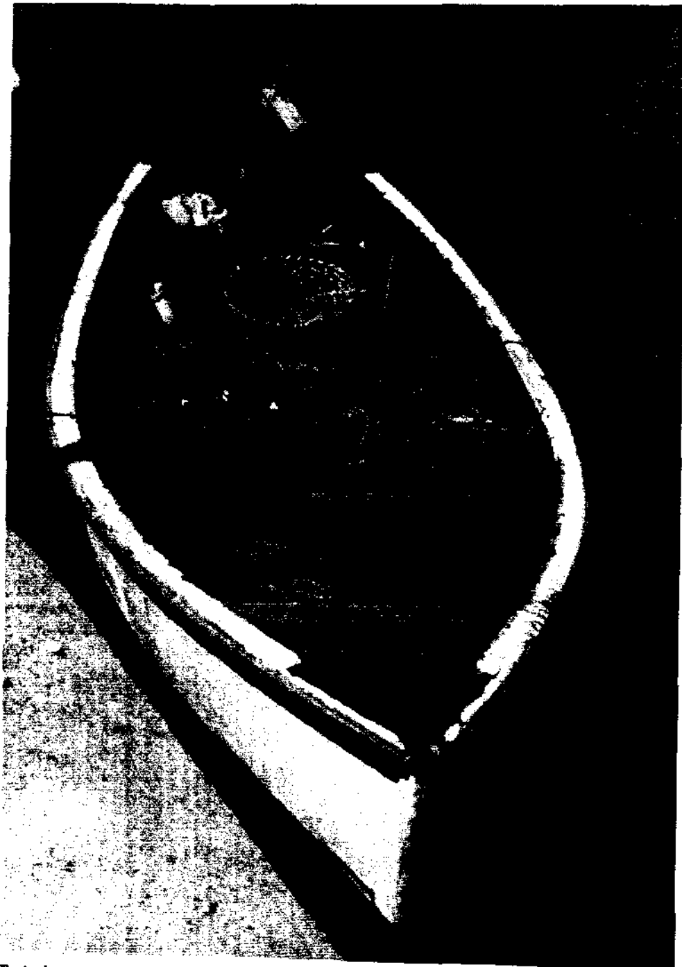
Typical crab harvesting boat in Venezuela.